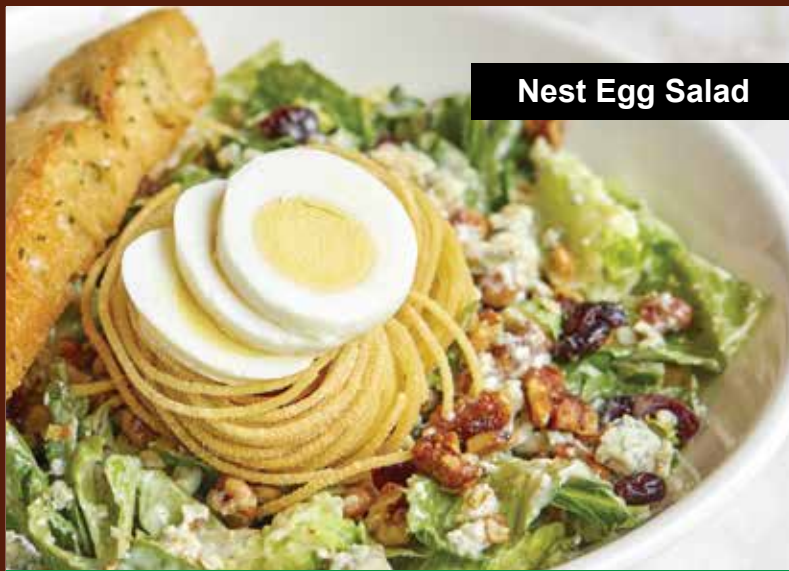
Nest Egg Salad