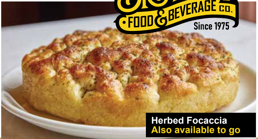
Herbed Focaccia Also available to go

The OLD BROADWAY FOOD & BEVERAGE CO. Since 1975